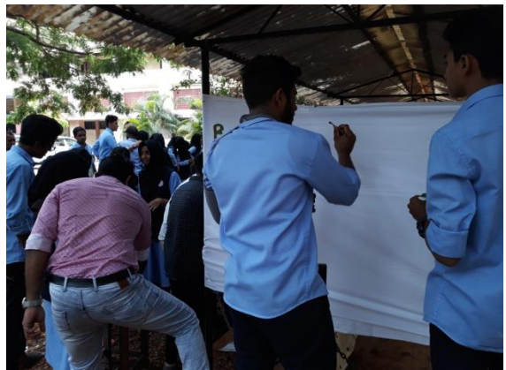
Fig: 2 Social painting on a common canvas

In the afternoon interdepartmental face painting competition was conducted on the topic 'Save Forest: save Life'. 16 groups representing various departments participated in the competition. Students actively participated by portraying different sketches conveying the of importance of conservation of forest for the existence of life on earth. The prizes were distributed to the winners by the Principal