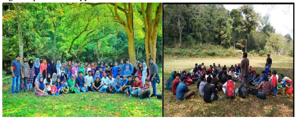
Fig Camp cetre at Kayyeni