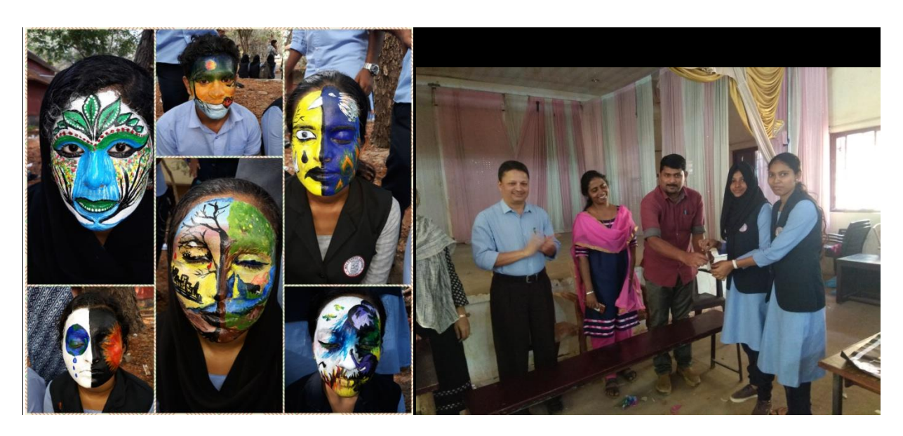
Fig: Face painting Competition winners